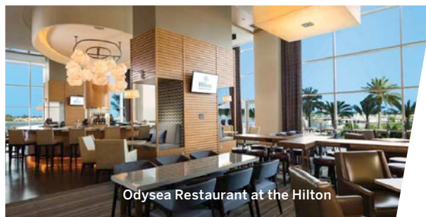
Odysea Restaurant at the Hilton

Odysea Library (Adjacent to the Odysea Restaurant at the Hilton)